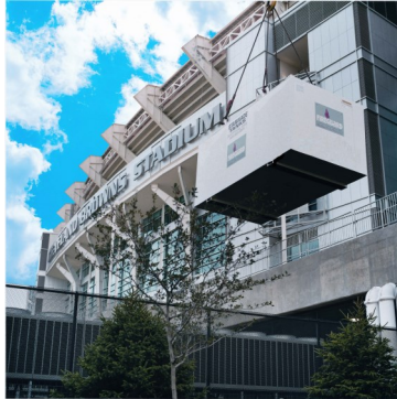
BACKUP POWER GENERATION