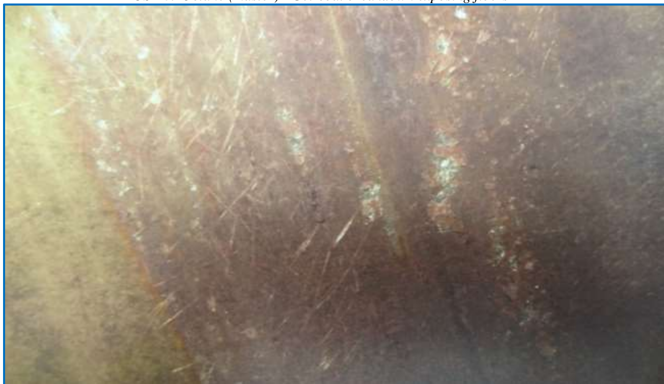
UST 87 Octane (master) - Gel-coat breakdown exposing fibers