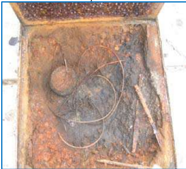
Corroded Incompatible ATG Probe