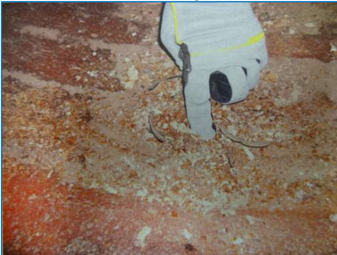
UST 87 Octane internal view: gel deterioration