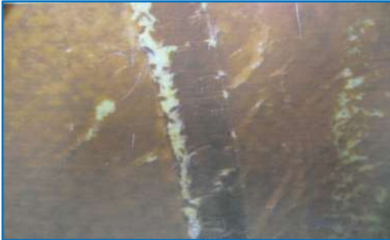
92 Octane UST – breakdown observed during pre-blast inspection