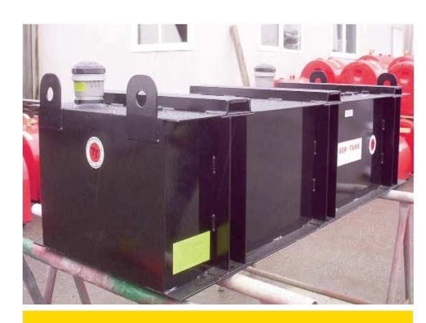
Compatible with ASTM fuels including biodiesel and renewable diesel blends.