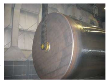
Steel can be recycled repeatedly without loss of its inherent strength and durability.

Embodied energy includes the manufacture, shipment, transport, and all other aspects of producing a product.