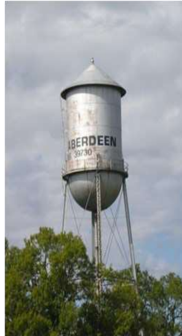
Steel is strong and durable. This steel water storage tank in Aberdeen, Mississippi, has been in continuous use for more than 100 years. STI/SPFA's Century Club recognizes many tanks like this throughout the US.

The steel and iron industries enjoy an "open-loop" recycling capability, meaning that available scrap typically goes to the closest melting furnace. This allows energy savings on transportation, too.