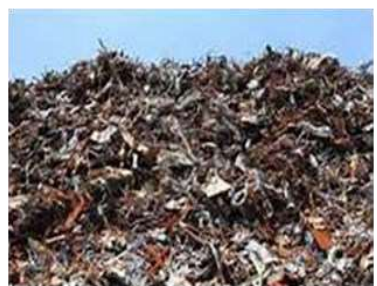
92% of steel is recycled in North America each year, more than paper, aluminum, plastic and glass combined.

According to a 2011 study, almost 55% of US businesses now have a formal sustainability strategy.