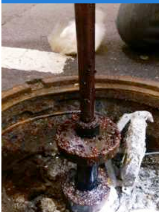
F1. - ATG Floats w Corrosion Products