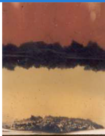
F2. - Diesel Tank Bottom Sample w Microbes