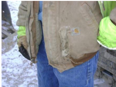
Torn operator jacket

The operator of a Caterpillar 315C track excavator climbed into the excavator. The Pilot Control Lever was engaged in the “safe” position. As he turned to position himself into the seat a hole in his jacket became caught on the left side boom control lever. Unaware of this, he bent over to release the Pilot Control Lever which enabled the controls. As he bent back up, the left side boom control lever moved back causing the boom to move towards the track. At the same instant this occurred a laborer was walking in front of the track excavator from the operator’s right to left, between the bucket and the track. As a result, the laborer’s right leg was caught in a pinch point and severed above the ankle. The laborer was flown to a major hospital where an unsuccessful attempt was made to reattach the foot.