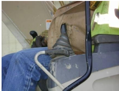
Jacket on control lever