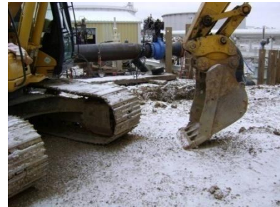
Position of bucket prior