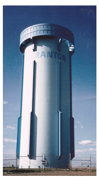
1984 Steel Tank of the Year