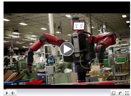
Video: 2013 MFG DAY

While the date has not yet been set for 2014, check out this video of 2013's celebration. Looks like an effective way to get local coverage of your business. We'll keep you posted on NAM's 2014 plans.