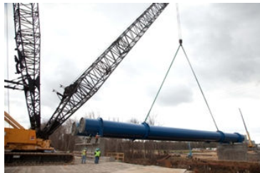
2011 Pipeline Project of the Year HANSON PRESSURE PIPE