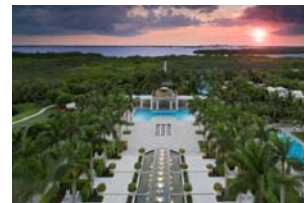
Hyatt Regency Coconut Point, Bonita Springs FL

A word to the wise, though: Lots of folks enjoy Florida in March, so make your air reservations now! Annual Meeting program and registration information will be available in December, but don't wait until then to book your flight.