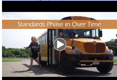
EPA video: Greenhouse Gas Emissions Standards for Heavy Duty Vehicles

On August 16, the U.S. Environmental Protection Agency and National Highway Traffic Safety Administration finalized the latest round of more-stringent greenhouse gas and fuel efficiency (GHG/FE) standards for new large and heavy-duty vehicles, like buses and tractor-trailers.