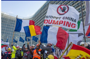
Anti-dumping demonstration in China

Over the past few years, "Chinese steel" and its invasion of the US market has caused consternation among both producers and manufacturers. In mid-April, the Office of the US Trade Representative held public hearings where several steel industry leaders spoke against what they believe to be illegal "dumping" of over-supply into the US steel market by China.