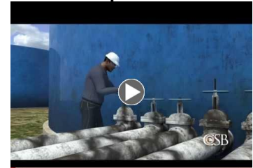
This is the CSB's Safety Video on the 2009 massive explosion at the Caribbean Petroleum, or CAPECO, terminal facility near San Juan, Puerto Rico. The incident occurred when gasoline overflowed and sprayed out from a large aboveground storage tank, forming a 107-acre vapor cloud that ignited.

While there were no fatalities, the explosion damaged approximately 300 nearby homes and businesses and petroleum leaked into the surrounding soil, waterways and wetlands. Flames from the explosion could be seen from as far as eight miles away.