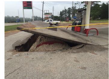
It's been a wet summer in Texas. "Heavy rains and the over-saturated ground forced a fuel storage tank at a retail store to surface back in June." yourhoustonnews.com