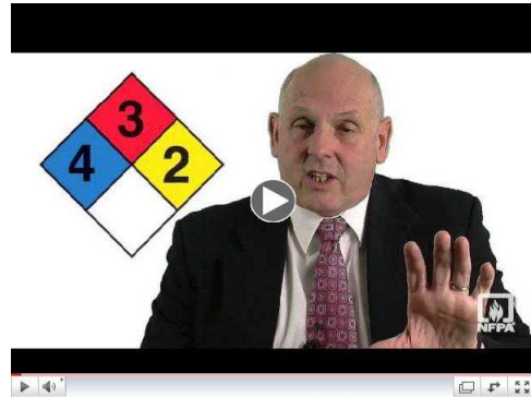
NFPA Journal - Hazard Labeling Guidelines in NFPA 704