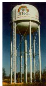
Left to right: single-pedestal spheroid tank (Wheaton, Ill.); three single-pedestal, fluted-column tanks (Bowie, Md.); composite elevated tank (El Paso, Texas); multi-column elevated tank (Beebe, Ark.)