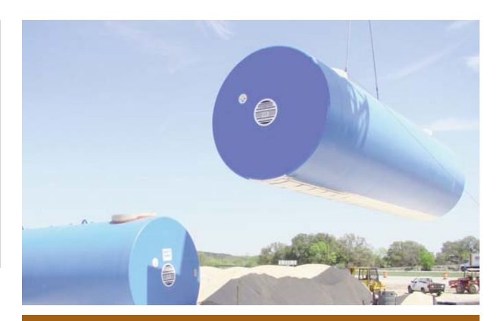
Compatible With a Wide Range of Fuels and Chemicals, Including Biodiesel and Ethanol

PROTECT THE ENVIRONMENT. BUY RECYCLABLE STEEL TANKS.