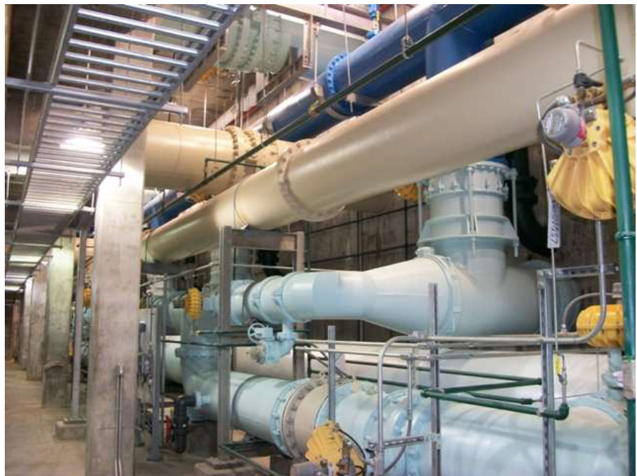
2012 Steel Pipe Fabrication of the Year Award Mid America Pipe Fabrication and Supply, LLC. Click here for description of Mid America's winning entry.