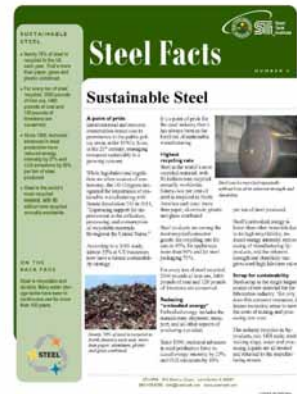
Exhibit banner promotes your company, value of steel

Email STI/SPFA right now to request PDF files of our five STEEL FACTS marketing sheets with your company's name and contact information right on the sheet . To see the Steel Facts marketing sheets, click here .