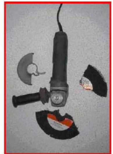
Angle grinder and disintegrated disk