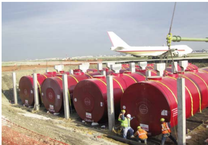
Features the strength of steel with a 100-mil fiberglass outer coating

ACT-100® Steel/FRP composite tank features a strong steel tank for structural integrity, and a 100-mil fiberglass outer coating for long-lasting corrosion protection. Double-wall design allows continuous interstitial leak detection and monitoring.