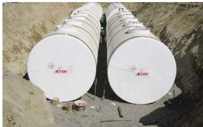
Compatible with a wide range of fuels and chemicals, including biodiesel and ethanol

PROTECT THE ENVIRONMENT. BUY RECYCLABLE STEEL TANKS.